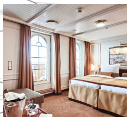
Category A: Suites with balcony. From