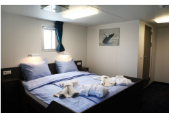
Triple Porthole Twin Porthole