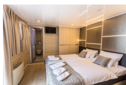
Upper Deck Cabin