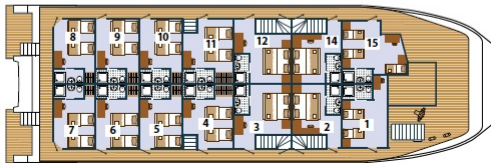
Lower deck cabin