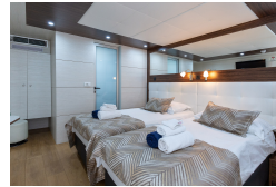
Lower deck cabin