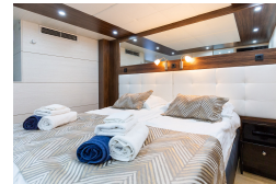
Main deck cabin