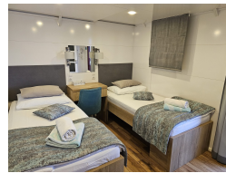
Lower deck cabin