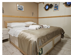
Main deck cabin