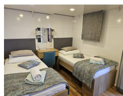
Lower deck cabin