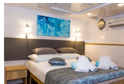
Main deck cabin