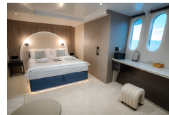
Below Deck Cabin