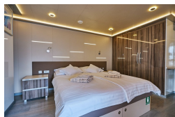
Above Deck Cabin