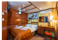
Lower deck cabin