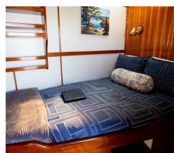
Cabin - Category 2, Option 2