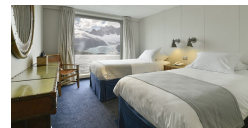
Cabin AAA Superior