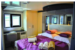
Upper Deck VIP Cabin with balcony