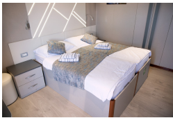
Above Deck Cabin