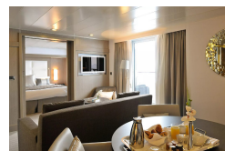
Prestige Deck 4