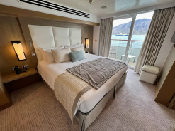
Prestige Deck 4