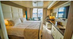
Prestige Deck 5