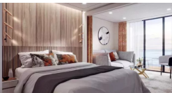
Balcony D6 - from