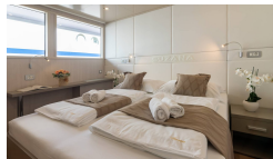
Lower Deck Cabin - waitlist