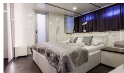
Lower Deck Cabin - waitlist