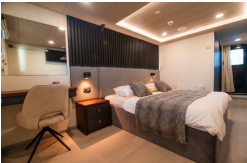
Main Deck Cabin (one available)