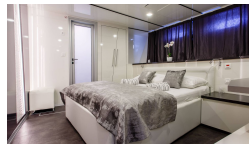
Lower Deck Cabin - waitlist