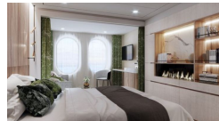
Oceanview M4 - from