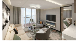
Suite - from