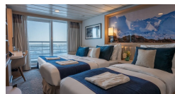
Category C XL Stateroom