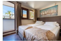
Below Deck Cabin