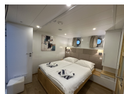
Upper Deck Cabin