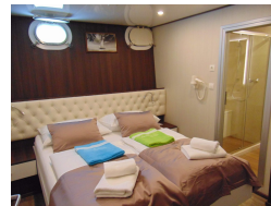
Upper Deck Cabin