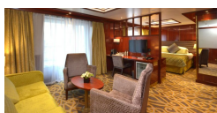
Explorer Deck Owner's Balcony Suite