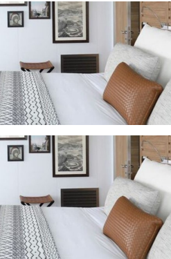
Forward Master Suite