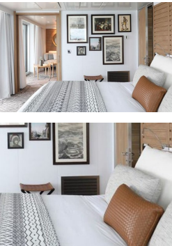
Forward Superior Suite