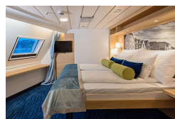
Arctic Superior. From