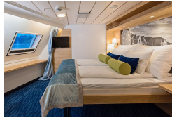
Arctic Superior. From