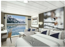
Aurora Stateroom Superior Single