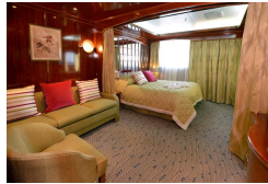
Mawson Deck Corner Suite