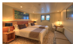
Main Deck B Stateroom