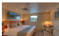
Promenade B Stateroom