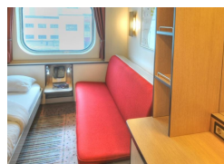
Polar Inside. From