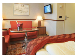
Polar Inside Unspecified