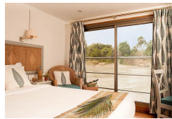
Main deck cabin for single passenger