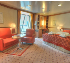
Polar Inside. From Polar Outside. From