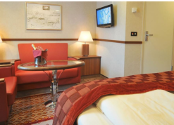
Fram - Polar Inside. From