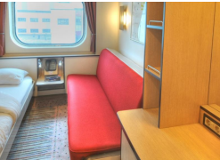
Fram - Expedition Suite. From