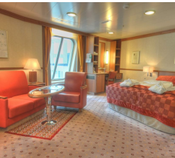
Fram - Arctic Superior. From