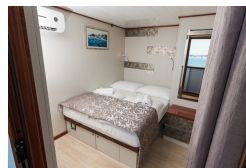
Below Deck Cabin