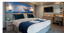
Category D Stateroom