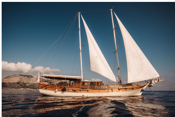
Deckhand & Steward

download limits. Amenities: Sailing equipment, snorkeling sets, kayaks, fishing rods, paddle boards, TV, DVD, music system, card games Crew: Captain, Chef,