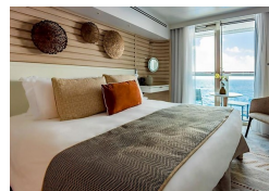
Upper deck balcony stateroom deck 5