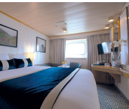
on Cabin deck 5