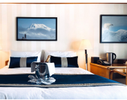
on Cabin deck 3