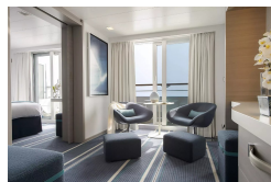
Prestige Deck 4