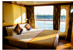
Luxury Cabin with Balcony