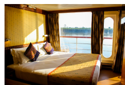
Luxury Cabins with Balcony