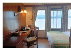
Suites with balcony