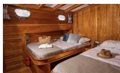
Grand Master Cabin