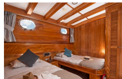
Superior Twin Cabin