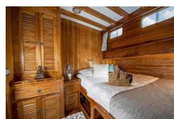
Superior Twin Cabin