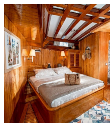
Superior Double Cabin