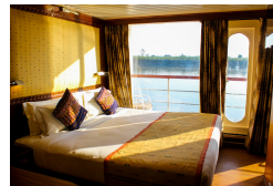
Luxury Cabins with Balcony