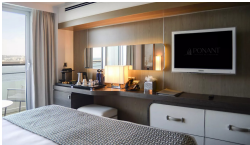
Prestige Deck 5