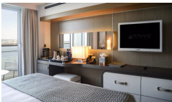
Prestige Deck 5 Suite