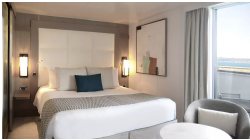
Prestige Deck 4