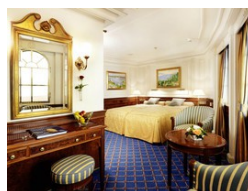
Category D. From