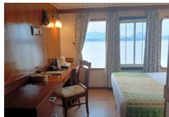
Suites with balcony - from