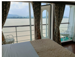
Superior cabin - from