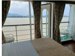
Superior cabin - from