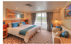
Main Deck A