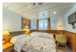
Category D Solo