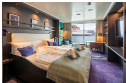
Quadruple Porthole Superior