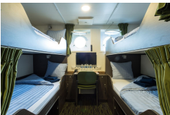
Superior Twin Deluxe Triple Porthole Twin Porthole