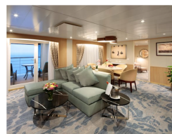
Star Balcony Suite - From